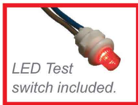
LED Test switch included.